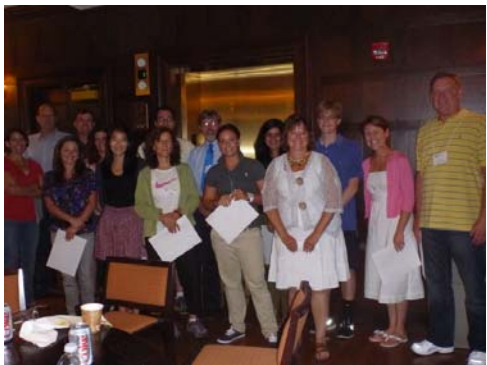
2012 Quest Participants

In July, fifteen New Jersey teachers of grades 3-8 from seven school districts participated in a CICS-sponsored summer institute in weather and climate. The program is hosted by the University's Program in Teacher Preparation, in collaboration with CICS. It is designed to enhance teachers' knowledge of science through inquiry-based experiences, emphasizing self-directed investigation rather than textbook learning.